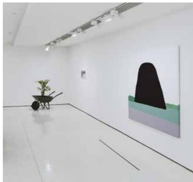
Installation view, UBS MAP Global Art Initiative: Under the Same Sun - Art from Latin America Today Solomon R. Guggenheim Museum, New York, 2014

This somehow relates to what I said earlier inspired me about Matta's paintings, as being the metaphysical image of elements, or to what his son or other artists like Orozco were doing in space. I think painting has the potential to convey this type of immateriality or activity. It's at least what I like to think I am doing. Some years ago, I painted a mountain, which I named Pan de Azucar , like the famous one in Rio de Janeiro. When I was painting it, I was thinking of its sound and its volume. And I was thinking not to paint a linear portrait, but rather to depict its energy. I feel connected to both the notion of landscape and the elements of the natural world, and also to working with architecture itself as a support, so these forms that have recently appeared in my canvases evoke either one world or the other. I relate the trapezoid to a building, for example. The smaller graphic figures that appeared in my work sometimes are, for me, part of a narrative that tells a story, like characters that populate a given place. These kinds of drawings, however, have also gradually disappeared from my work, sometimes completely.