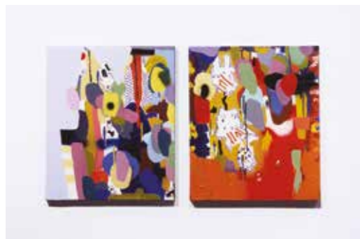
Federico Herrero Landscape (diptych), 2004 21st Century Art Museum of Contemporary Art, Kanazawa

And where does gravity do its work? What is grounding in this respect?