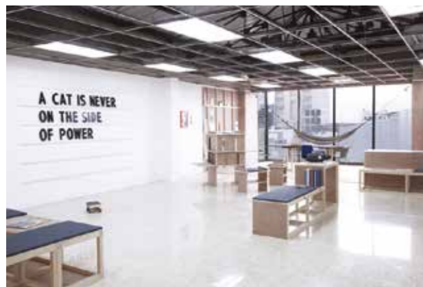
Installation view, Absence of logic, 2016 Despacio, San José